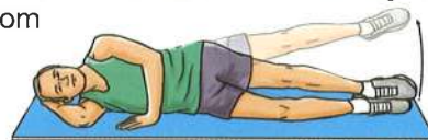
SIDE-LYING LEG LIFT

9. SIDE-LYING LEG LIFT: Lying on your side, tighten the front thigh muscles on your top leg and lift that leg 8 to 10 inches away from the other leg. Keep the leg straight. Do 3 sets of 10.