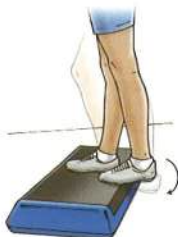
PLANTAR FASCIA STRETCH

After you have stretched the bottom muscles of your foot, you can begin strengthening the top muscles of your foot.