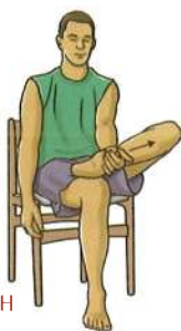
SITTING PLANTAR FASCIA STRETCH

When you can stand comfortably on your injured foot, you can begin standing to stretch the bottom of your foot using the plantar fascia stretch.