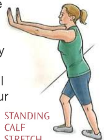
STANDING CALF STRETCH

2. STANDING CALF STRETCH: Facing a wall, put your hands against the wall at about eye level. Keep one leg back with the heel on the floor, and the other leg forward. Turn your back foot slightly inward (as if you were pigeon-toed) as you slowly lean into the wall until you feel a stretch in the back of your calf. Hold for 15 to 30 seconds. Repeat 3 times. Do this exercise several times each day.