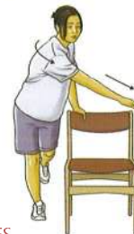
BALANCE AND REACH EXERCISES

B. Stand in the same position as above. While maintaining your arch height, reach the hand farthest away from the chair across your body toward the chair. The farther you reach, the more challenging the exercise. Do 2 sets of 10.