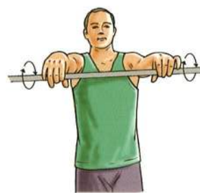
WRIST EXTENSION (WITH BROOM HANDLE)

8. WRIST EXTENSION (WITH BROOM HANDLE): Stand up and hold a broom handle in both hands. With your arms at shoulder level, elbows straight and palms down, roll the broom handle backward in your hand. Do 3 sets of 10.