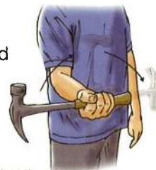
FOREARM PRONATION AND SUPINATION STRENGTHENING

7. FOREARM PRONATION AND SUPINATION STRENGTHENING: Hold a soup can or hammer handle in your hand and bend your elbow 90°. Slowly rotate your hand with your palm upward and then palm down. Do 3 sets of 10.