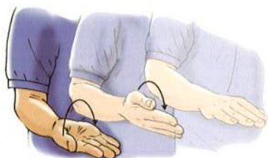
FOREARM PRONATION AND SUPINATION

2. FOREARM PRONATION AND SUPINATION: With your elbow bent 90°, turn your palm upward and hold for 5 seconds. Slowly turn your palm downward and hold for 5 seconds. Make sure you keep your elbow at your side and bent 90° throughout this exercise. Do 3 sets of 10.